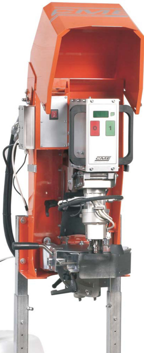
Mini Junior PRO H (For rig mounting)

Down the Hole Bit, shank diameter, max 140mm (5 1/2")